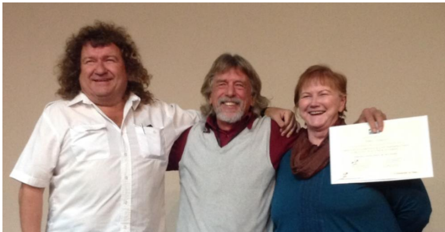
Some original HISPP members – could they be the HISP Geriatric Society or the Geriatric HISP Society ...