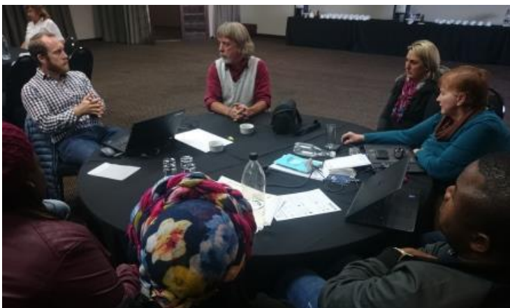
End of day trainers meeting